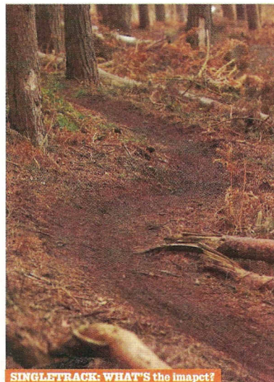
SINGLETRACK: WHAT'S the impact?

The study can be found at the US IMBA website: www.imba.com/resources/science/marion_nps_report_intro.html .