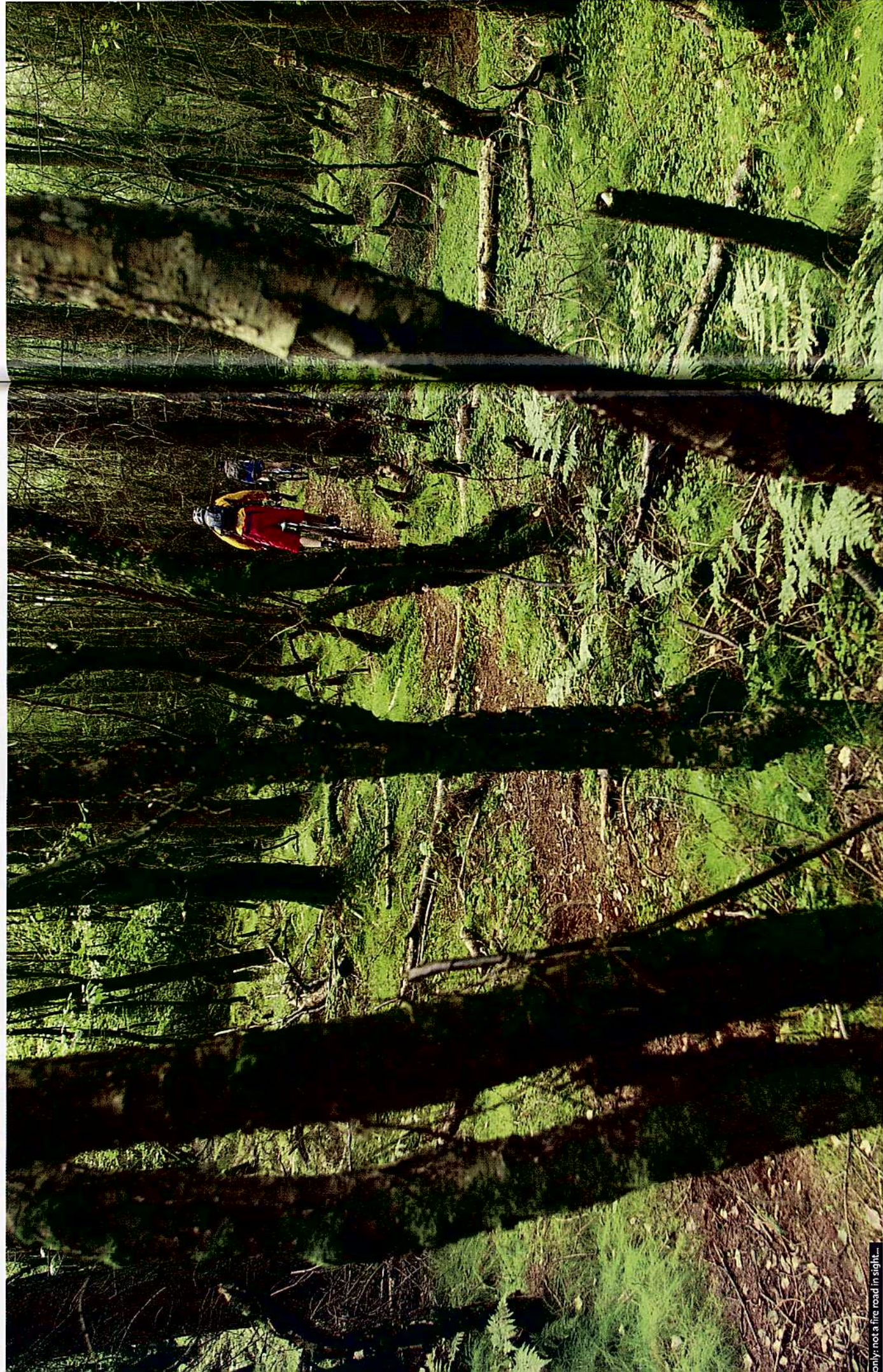
...only, not a fire road in sight...