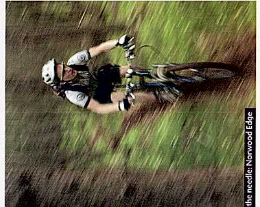
...the needle: Norwood Edge

Around five miles of singletrack has been shoehorned into Stainburn's tiny footprint. The bulk of it tangles through the upper part of the forest on the north →